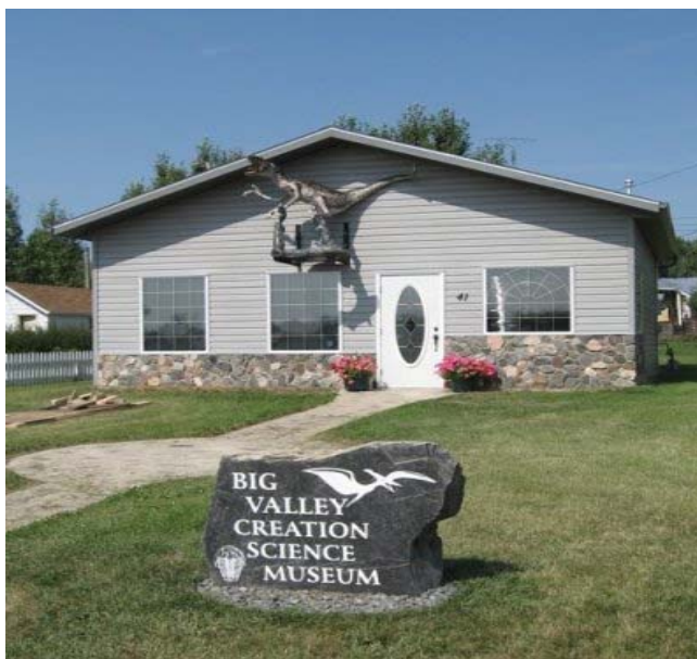
Creationism Museum in Canada

Now, incredibly, Canada seems to be following the same path toward such folly. Here’s how.