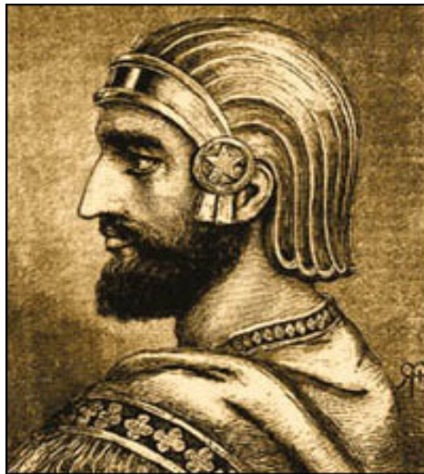
Cyrus the Great

tar of free speech or any other human rights, having ordered the closing of newspapers and imprisoning of people critical of his policies, and persecuting university professors he deems too liberal or secularist. Defending human rights is very low on his agenda.